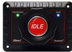
Class1 Sentry Governor/Twister Throttle