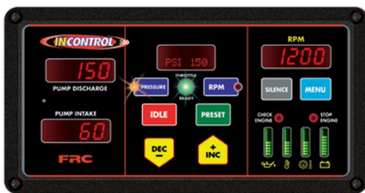
Fire Research Corp InControl