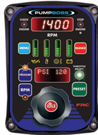
Fire Research Pump Boss