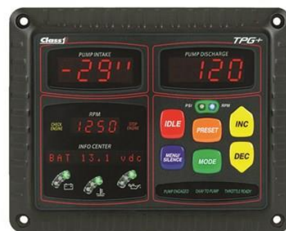
Class1 Total Pressure Governor Plus