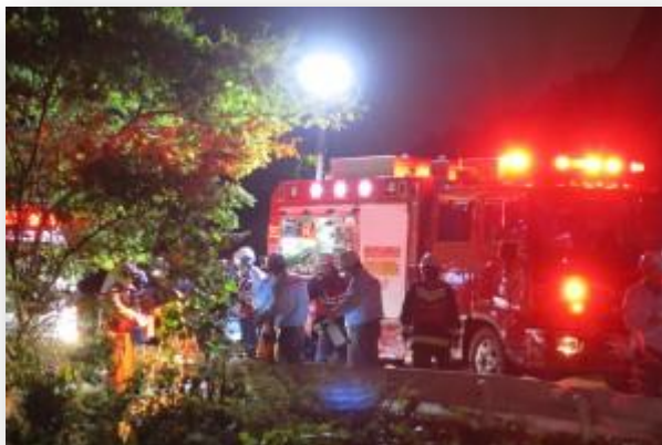
LED lights at the scene of a motorcycle accident in Japan.