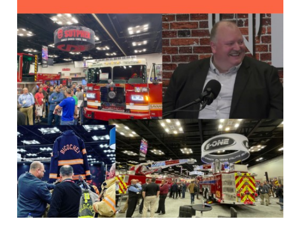
Thank you to FAMA Technical Committee

Our members presented cuttingedge fire apparatus, emergency vehicles and innovative safety equipment, reflecting their commitment to enhancing fire safety and emergency response capabilities.